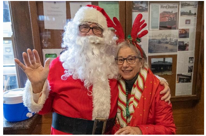
Santa doing his magic!